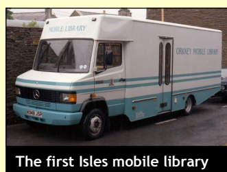
The first Isles mobile library

The first Mobile Library vehicle served for nine years before it was replaced in 1972 by a second vehicle which served until 1981. When the third vehicle entered service in 1981 the old Mobile Library was sent to Basilicat in the south of Italy to provide a temporary school library service following the devastating Irpinia earthquake in November 1980 which killed 2,483 people and left 250,000 people homeless. The third vehicle was replaced in 1990 but instead of being taken off the road it was used to extend the Mobile Library Service to the islands of Orkney for the first time.