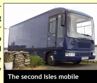
The second Isles mobile

In November 1990 following the introduction of roll on/roll off ferries to the south and inner north isles of Orkney, it became possible for the Mobile Library to travel to the islands giving the islanders the opportunity to choose their own books for the first time. It was another resounding success for Orkney Library and eventually another new vehicle was ordered to operate solely on the isles service. In August 1994 the Mobile Library Service was extended again to serve the remaining outer north isles meaning that for the first time ever the majority of the rural and island population of Orkney had direct access to Orkney Library through the Mobile Library Service.