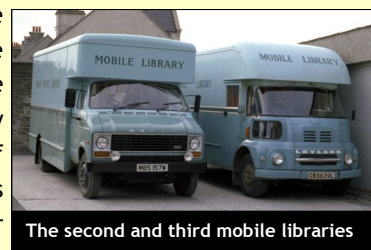
The second and third mobile libraries

News of the service quickly spread and the number of users began to increase; the second trip around the mainland saw a fifty percent increase in books borrowed and more households were added to the route. In a very short time the Mobile Library was stopping at 750 households on each trip around the mainland and with the inclusion of those who were using the village stops it meant there were well over one thousand families being served by the Mobile Library Service. The growing success of the service meant that the route had to be extended twice over the next few years and by 1983 each trip around the mainland was taking nine weeks with an average issue of 70,000 books each year. This meant that 40% of the total rural population of Orkney was registered with the Library and in households served by the Mobile Library Service over 84% of the adult population were regularly reading library books.