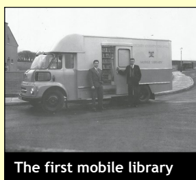
The first mobile library

The Orkney Mobile Library Service was established in the spring of 1963 with the aim of providing readers who lived in rural areas of the Orkney mainland with the same access to library books as those living in Kirkwall or Stromness, or those living in the islands being served by the Family Book Service which had been established in November 1954.